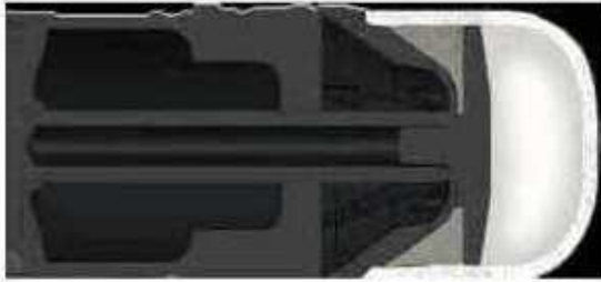
Prior to Impact